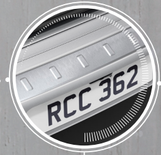
BRIGHT REAR SCUFF PLATE