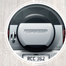
SPARE WHEEL COVER