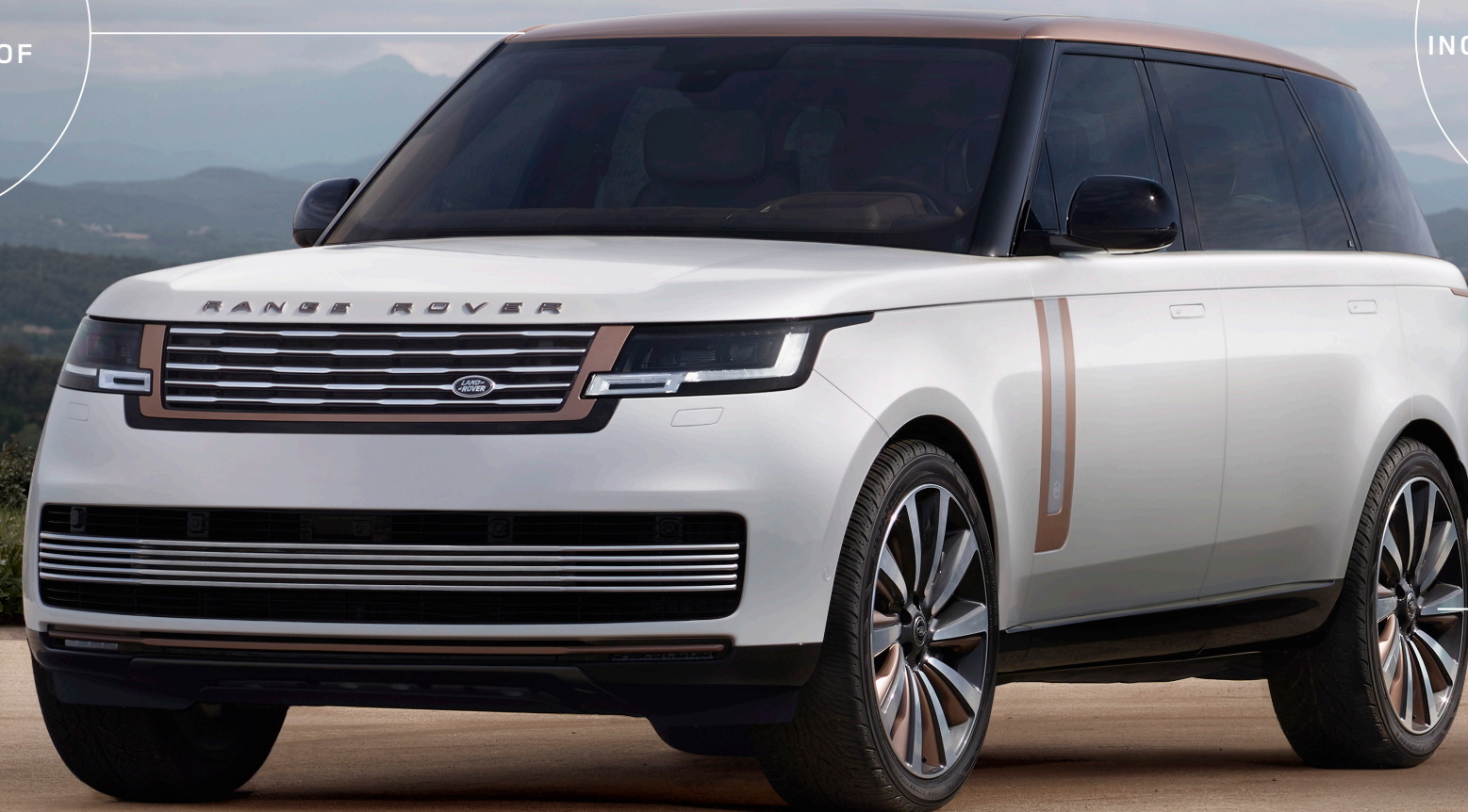
SV SERENITY THEME PURE LUXURY

14 OPTIONAL SV PREMIUM PALETTE PAINT COLOURS