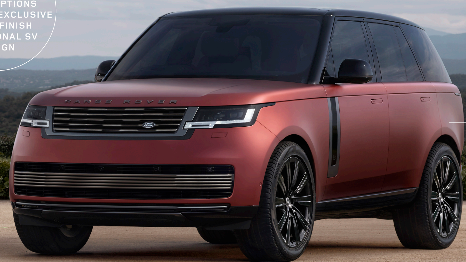
SV INTREPID THEME STEALTHY DYNAMIC